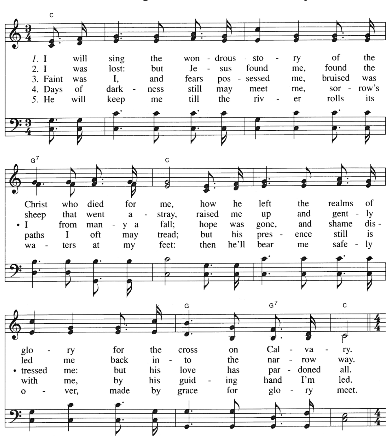
I Will Sing the Wondrous Story