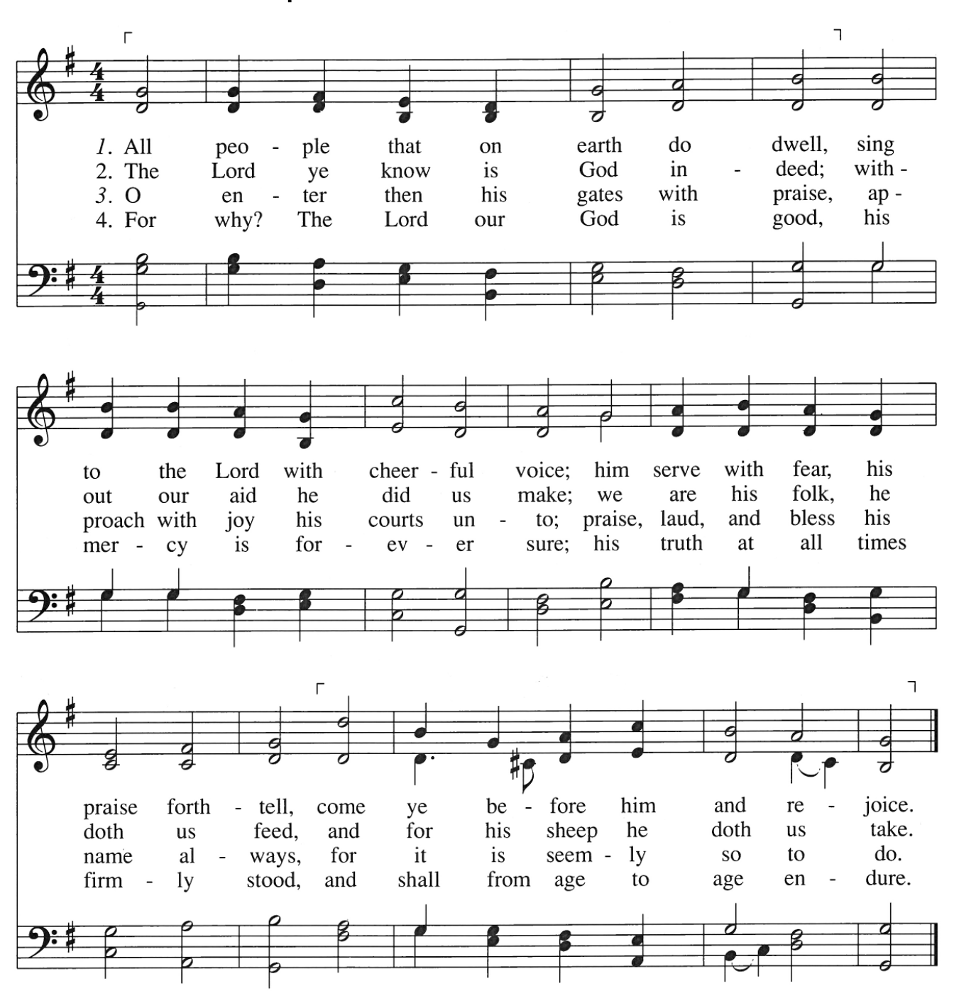
All People That on Earth Do Dwell